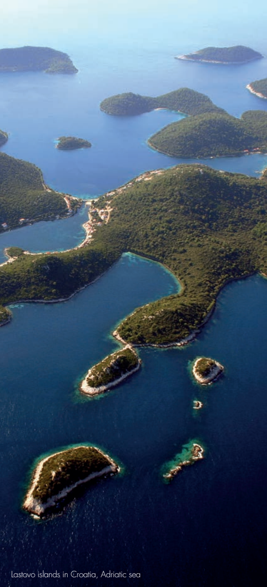
Lastovo islands in Croatia, Adriatic sea