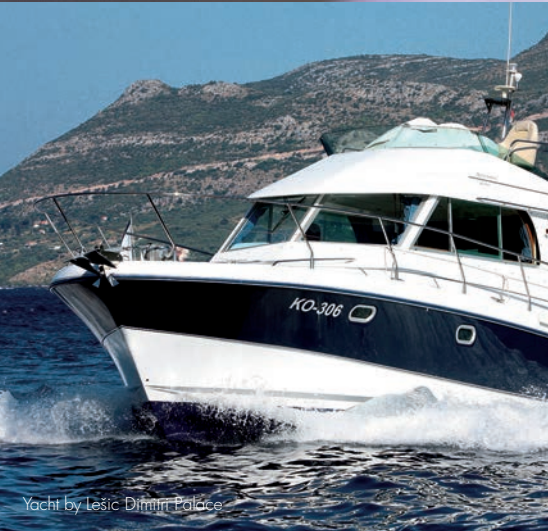
Yacht by Lesic Dimitri Palace