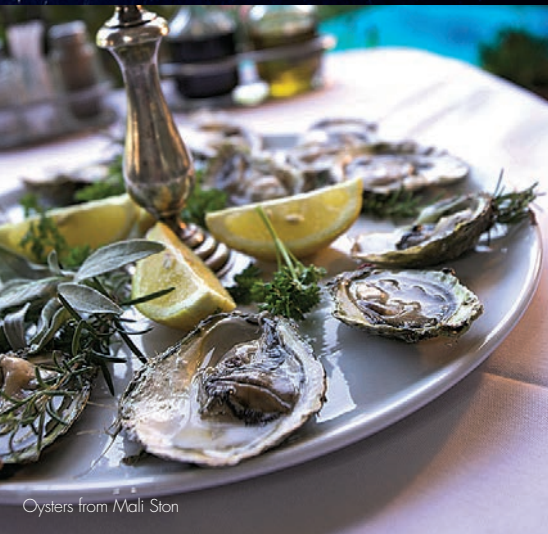
Oysters from Mali Ston