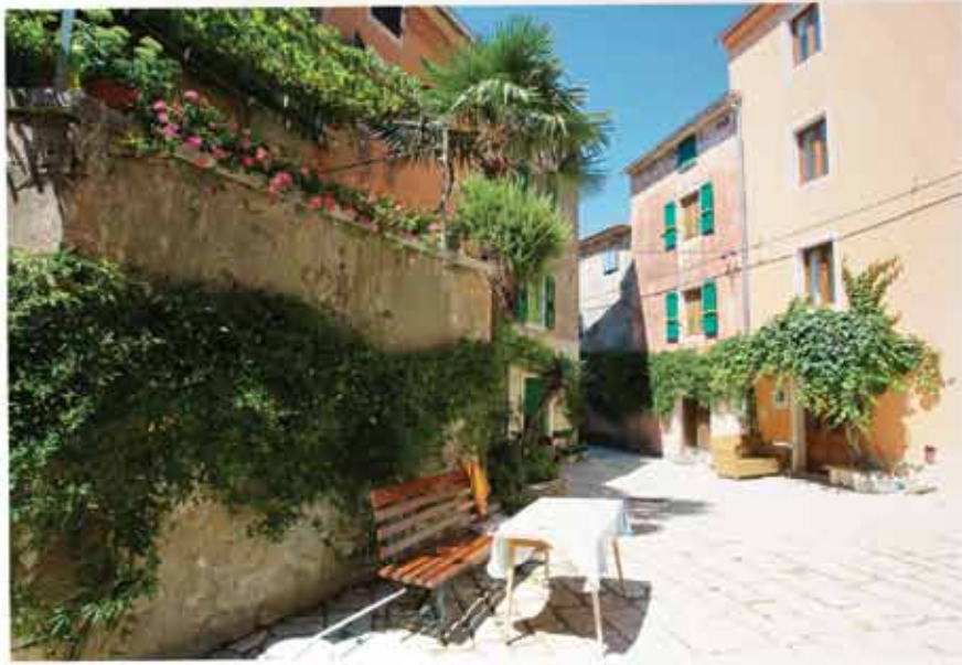
Ursar's hidden streets, terraces and courts, siesta