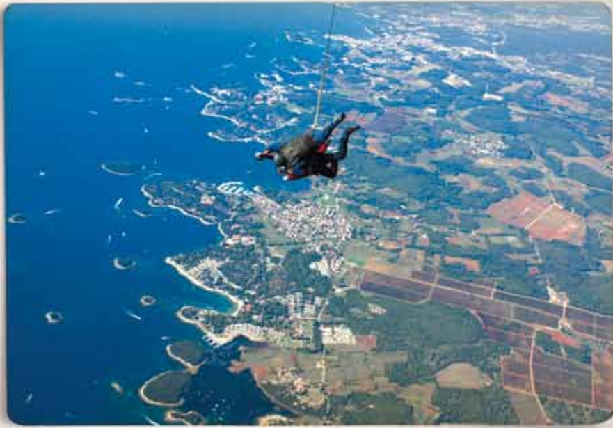
The Ursar's airport, with its flights in the Istrian skies...panoramic parachute jumps, tandem jumps, sky pic-nics, aerial excursions, panoramic flights...