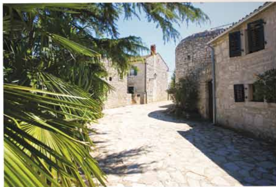
one of the towers, part of the Medieval town walls