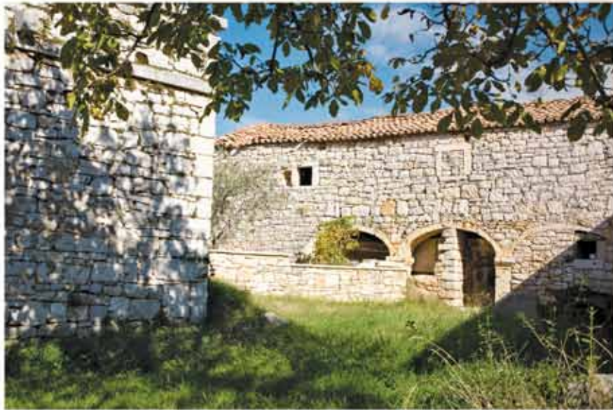
The peace of the adjacent villages, various perfumes and flavours.