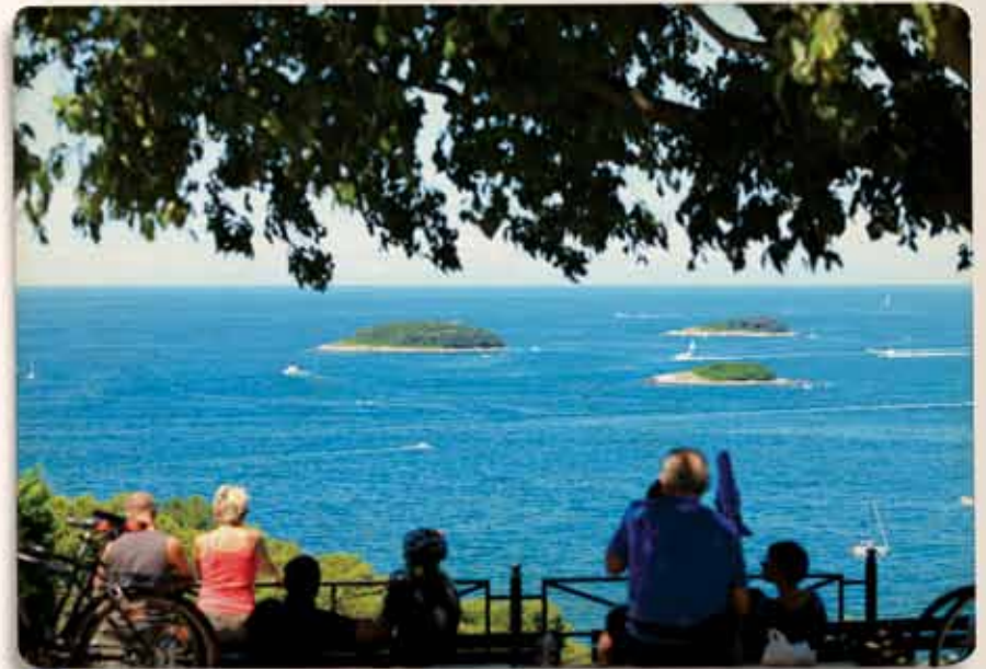
2. Viewpoint Behind the Church