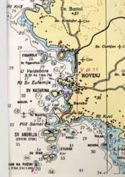
...while the diving centres here offer the opportunity to explore the mystical sea bed, and two famous protected shipwrecks: the Austro-Hungarian passenger ship Baron Gautsich and the British battleship Coriolanus... and numerous other archaeological undersea findings... guided undersea tours...