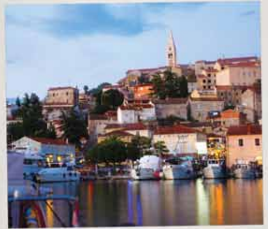
Poreč, Istria, Croatia