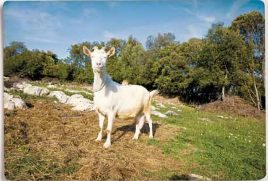
The goat, historical symbol of Istria.