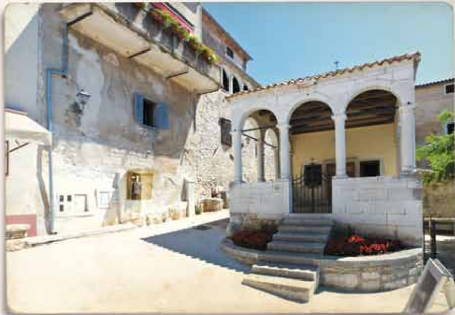
small Church of St. Anton, in front of the western town gate della città