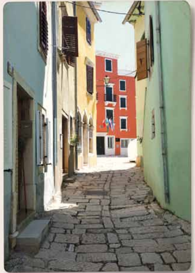
Along the paved path towards the main square