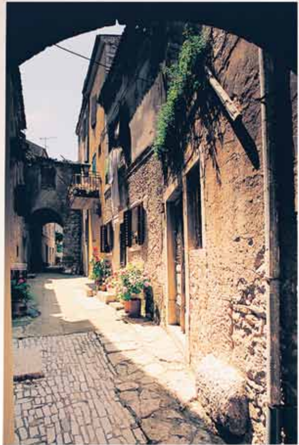
"Pod Voltom" street