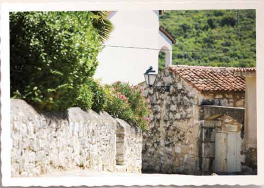
Dry stone walls, passages and doorways