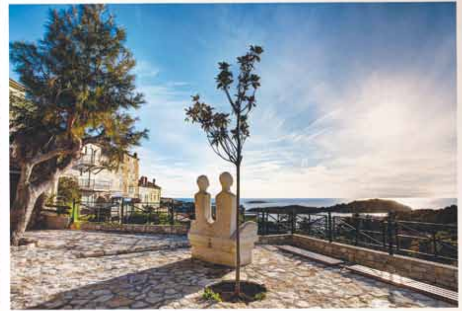
3. Bepo and Tonina